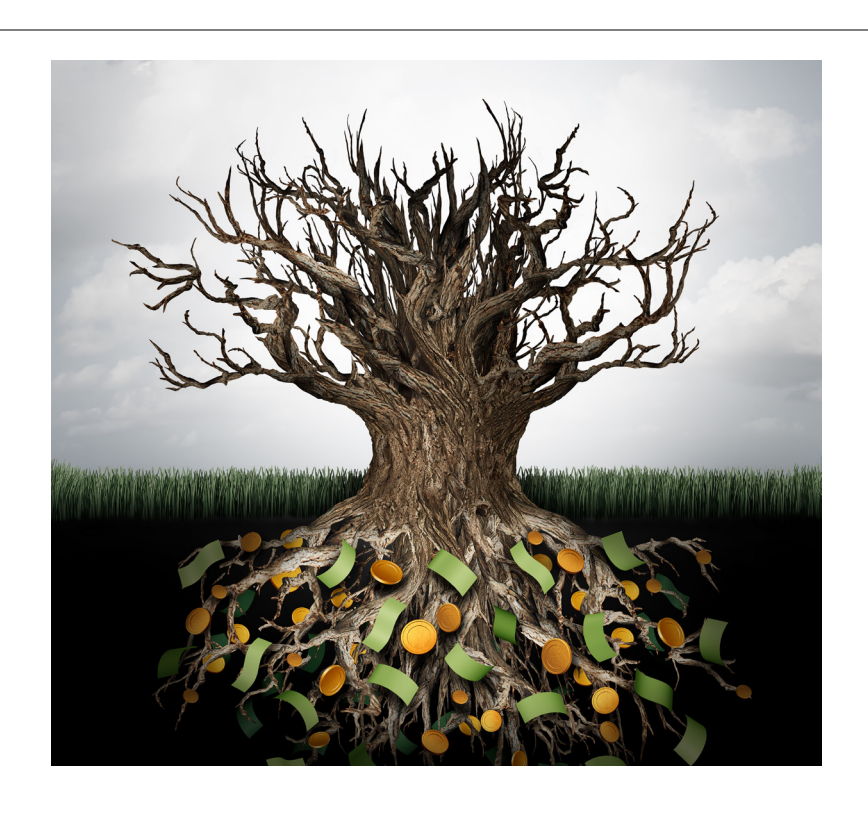
Policy Department D for Budgetary Affairs

Directorate General for Internal Policies of the Union PE 572.717 - April 2017